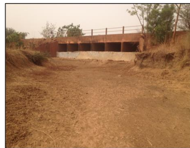
A wall built under a bridge in Lawra to retain water