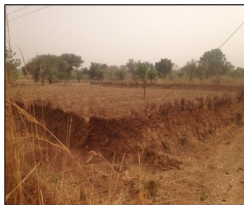
Mud used to retain water in cultivated land in Lawra