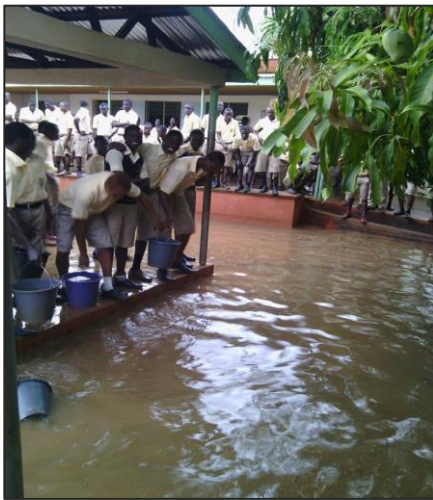
Students collecting floodwater

Temperatures across the region have increased by 1°C on average over the past 50 years. The largest temperature increases have been observed in the March to May season. Warming has been less pronounced in the summer months and some locations have cooled in the summer and winter seasons. Future projections of temperature change show significant increases across the region. Temperatures in the north of the region, from the Sahel to the Sahara, are projected to increase by 2°C on average by the 2040s with increases of over 3°C projected for some parts of the Sahara. Rainfall trends over the past 50 years are less evident than for temperature, and there are large variations in the direction and magnitude of changes across the region. There is evidence of a shift in the rainy season towards later rainfall for some regions. An increase in rainfall in some locations for some seasons is observed but a decrease in rainfall is observed elsewhere. In general, trends are weak. Future model projections of rainfall contradict each other, showing both potentially large increases and decreases. Projections of rainfall vary considerably. At present there is insufficient evidence to support either a shift to drier or wetter conditions in the future in most locations.