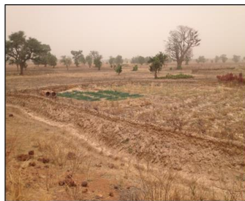
An onion garden in Lawra dry lands

The development of national level policy frameworks for adaptation planning is proceeding well in both Mali and Ghana. These national policies provide general guidance for investments and actions aimed at addressing adaptation needs. However, there are a lack of effective mechanisms, financial resources, and institutional capacities in place to effectively implement adaptation frameworks. Climate finance mechanisms are increasing in Ghana and Mali, which can help to mobilize resources for adaptation, however these mechanisms do not effectively engage the private sector.