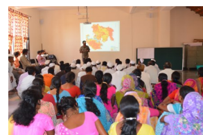
It is important for stakeholders to understand spatial variation in groundwater availability