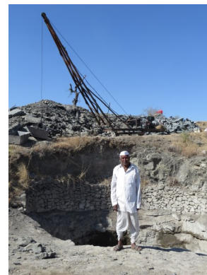
Farmers resort to deepening their wells in the hope of tapping more groundwater