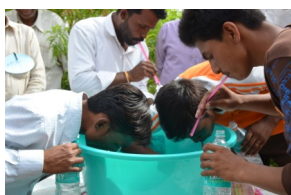
Common pool groundwater resources are comparable to people drawing water from the same bucket