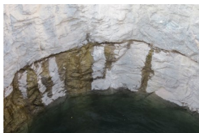
Groundwater occurrence is dependent on the architecture and morphology of multi-layered basalts

Brief based on: Thomas R, Duraisamy V, Egypt J. (2016) Hydrogeological delineation of groundwater vulnerability to droughts in semi-arid areas of western Ahmednagar district. The Egyptian Journal of Remote Sensing Space Science . http://dx.doi.org/10.1016/j.ejrs.2016.11.008