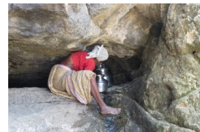
Misplaced wells can significantly alter the discharge of springs that tribal communities depend on for their drinking water