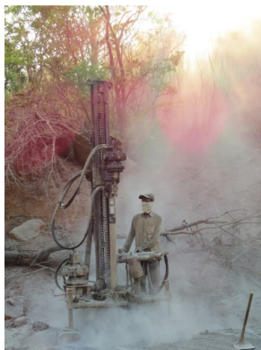
Unregulated bore-well drilling and bore-well use can lower the water table